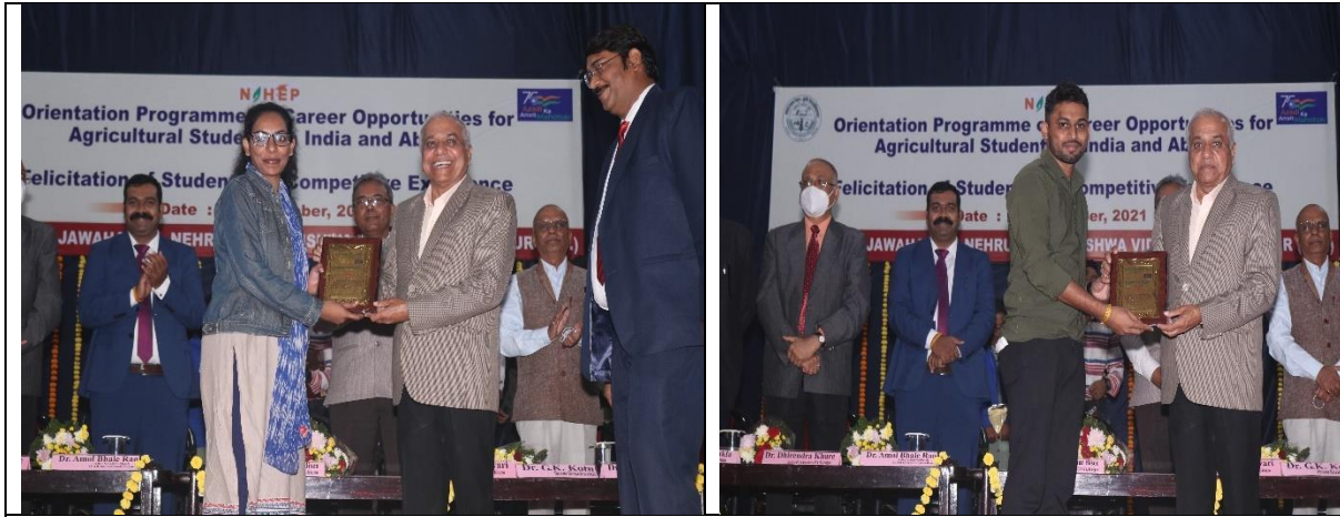
Medha Vikas programme to honour successful students